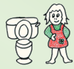
7. Use the toilet and flush it