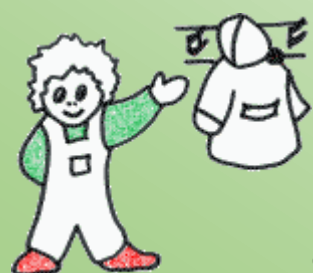
9. Take off their coat and hang it up